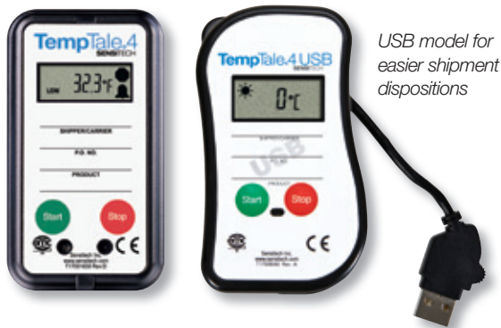
USB model for easier shipment dispositions

Our flagship temperature monitor offers customizable alarm settings to meet the widest array of in-transit and storage applications. The functional design of the alarm integrates pre-programmed time and temperature limits to trigger "time-out-of-range" events. The monitor quickly and easily downloads to a PC for detailed time/temperature history by using fast, reliable optical communications.