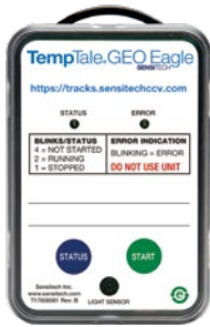
TempTale® GEO Eagle

Industry leading real-time monitoring suite provides global location and temperature range coverage to provide a complete real-time solution.