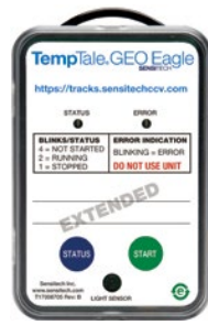
TempTale® GEO Eagle Extended

Frozen seafood, meat, fruits, vegetables and frozen desserts. Fresh fruits and vegetables that have longer shipments.