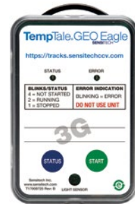
TempTale® GEO Eagle 3G

Frozen seafood, meat, fruits, vegetables and frozen desserts. Fresh fruits and vegetables that have longer shipments.