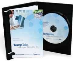
TempTale Manager® Desktop Software