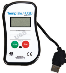
TempTale®4 USB Monitor