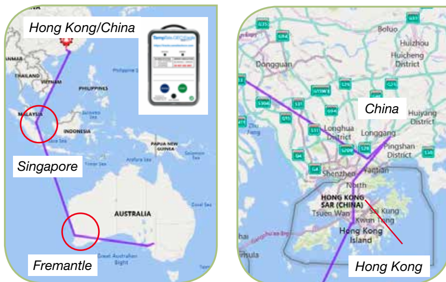
Figure 1. A Sensitech GEO Eagle temperature logger (inset) used to monitor a sea freight consignment of Crimson Seedless table grapes and its route from Mildura to Adelaide, Fremantle, Singapore and Hong Kong followed by road transport to China.

By monitoring the export cool-chain growers can determine the best route to market and highlight where temperature fluctuations are occurring. Improvements can then be made that enable fresh produce to arrive in Asian markets in the best possible condition further enhancing Australia’s reputation and lead to increased sales and profits in the future.