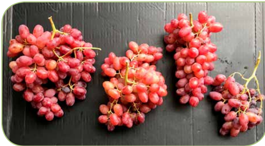
Visual inspection and quality assessment of Crimson Seedless table grapes in Guangzhou, China.

The larger spike in temperature was attributed to unloading at the port in Hong Kong and the subsequent road transport to the importers warehouse in Guangzhou, China.