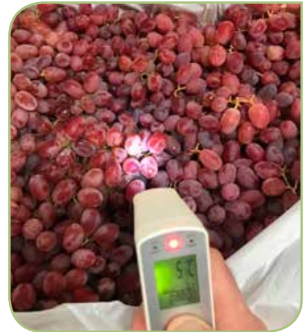
Measuring the surface temperature of Crimson Seedless table grapes with a handheld infrared digital sensor.

so that response functions can be developed to help predict changes in fruit quality and remaining shelf-life.