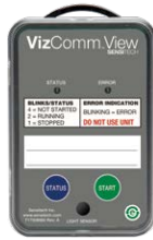
VizComm View 2G