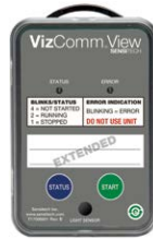
VizComm View Extended