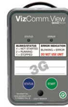
VizComm View 3G