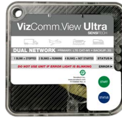
VizComm View Ultra