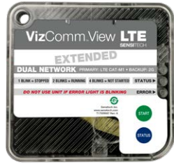
VizComm View LTE Extended