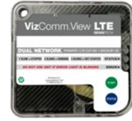
VizComm View LTE