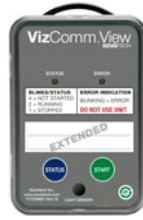
VizComm View Extended