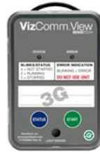
VizComm View 3G