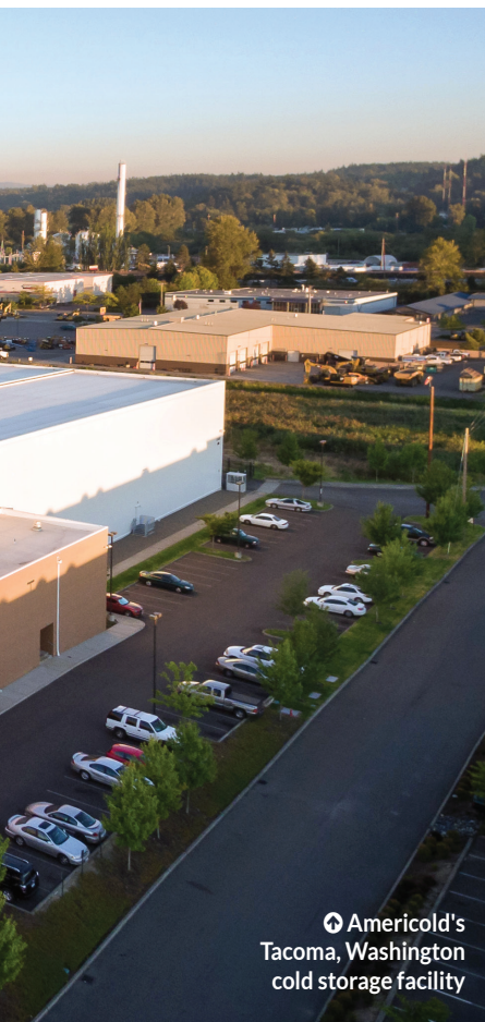
➤ Americold's Tacoma, Washington cold storage facility

are purpose-built facilities, and spec build really doesn't happen."